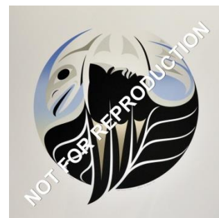
Over Black Tusk