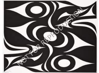
Wolves lessLIE, 2006