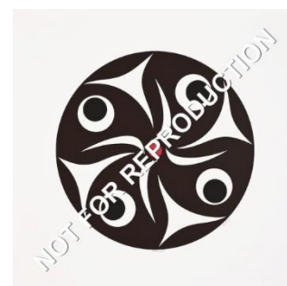
Middle Point lessLIE, 2008