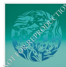
Celebration of Life Susan Point, 2014