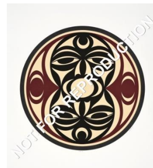
tHEIRS lessLIE, 2009