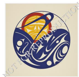
New Day Luke Marston, 2015