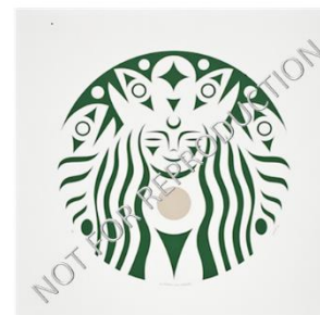
Cultural CununDRUM lessLIE, 2014

big bucks born in the salish sea starbucks a cultural parody taking salish land for lucrative coffee andy whorl painting startbucks spindle whorl as the w((h))orl(((d))) a big bucks core-poor-ration putting the poor on rations while the rich drink cultural coffEE a cultural parody lessLIE