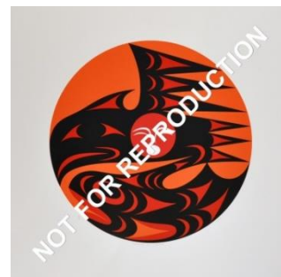
Thunderbird and Killer Whale lessLIE, 2004