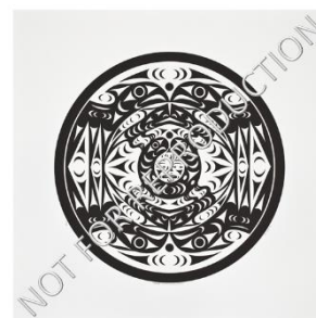
wHOLe W(((h)))orl(((d))) lessLIE, 2014