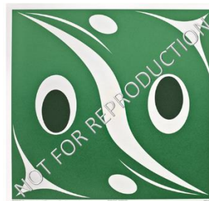
Protecting Posterity lessLIE, 2005