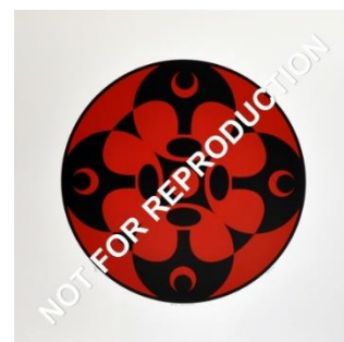
Salish Community lessLIE, 2007