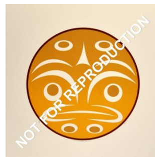
Sun, Salmon, Frogs and Ravens