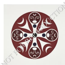
CommuniTIES lessLIE, 2010