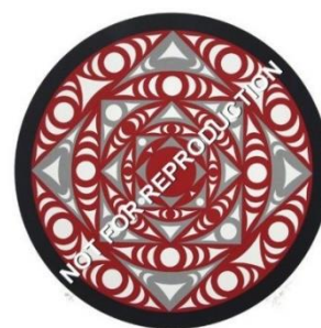
Mandala Dylan Thomas, 2010